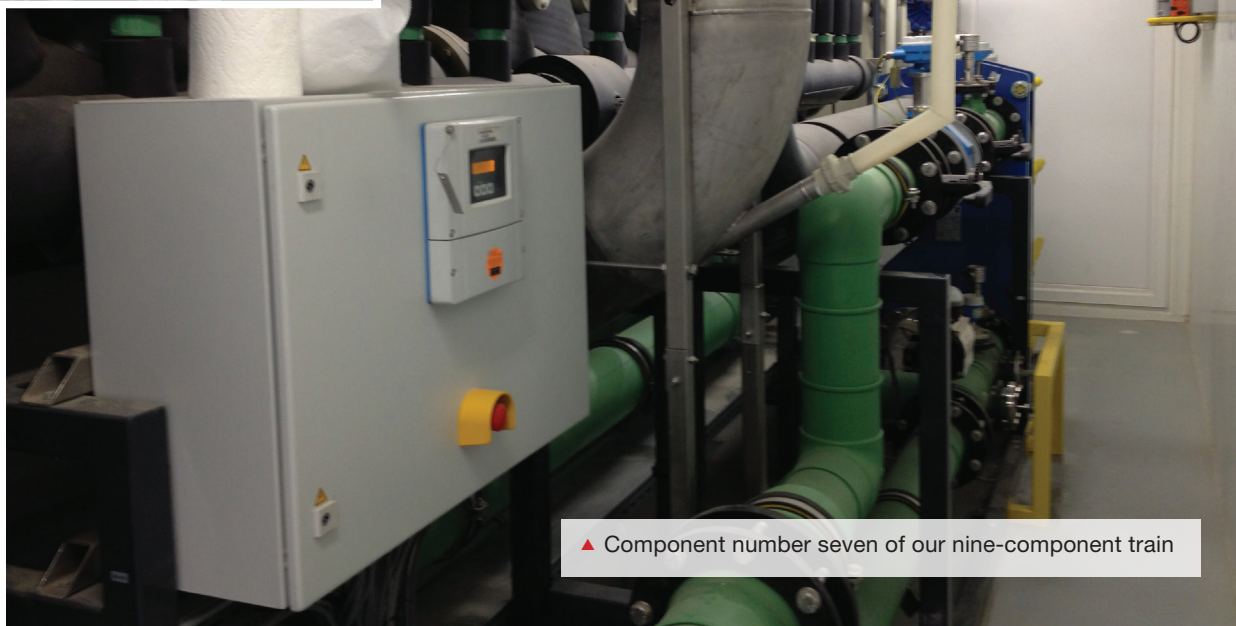
▲ Component number seven of our nine-component train

Several companies have attempted to extract metals and minerals from produced water, but failed because the water must be clean or the metals and minerals are contaminated by chemicals entrained within the produced water. This revenue stream has typically not been realized, leaving millions of unrecovered revenues.