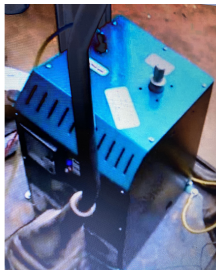
◀ Electronic brain

The system eliminates the need for power lines, hauling fuel to the site or other trucking needs, thus saving time and money. Part of the beauty of this complete system is no contaminants are emitted into the atmosphere, and any products used are Department of Environmental Quality