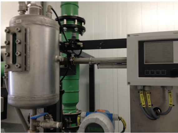
◀ Component number eight of our nine-component train